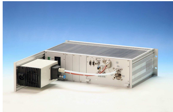
FID ES with external pump