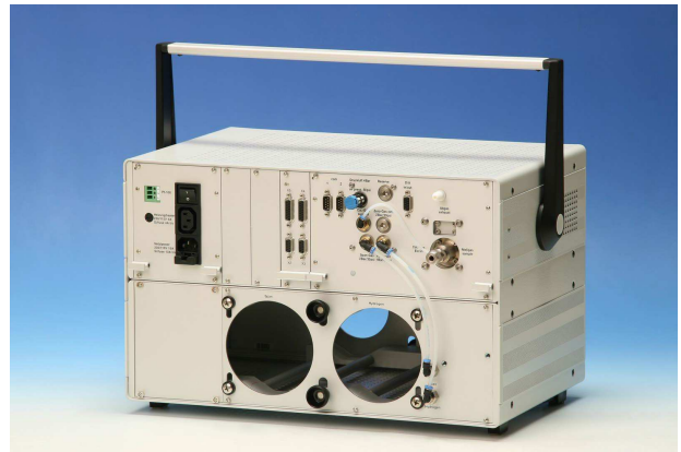
Back PT84 with bottleholder