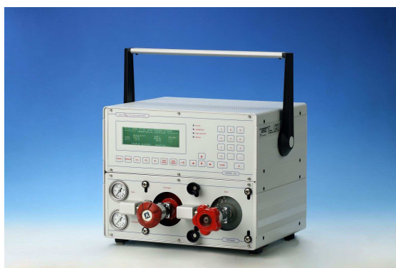
Front PT63 with bottleholder