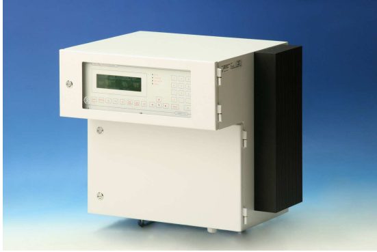
Front MK IP65